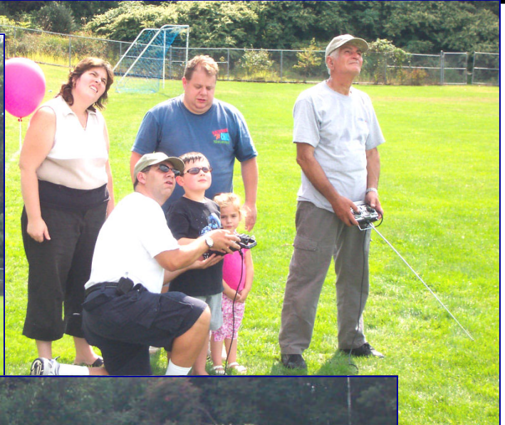
Yankee Doodle 2006!