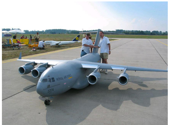
1/9th Scale C-17 R/C Model

Built mainly from balsa and ply, with many glass and carbon fiber moldings to reduce weight. This C-17 Globemaster III is one of the largest jet models in the world today! Complete with retractable landing gear and pneumatically operated flaps.