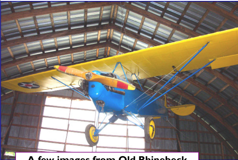
A few images from Old Rhinebeck Aerodrome - it's worth the trip!